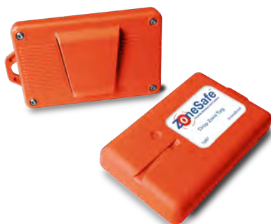
Drop Zone Tags (Rechargeable)